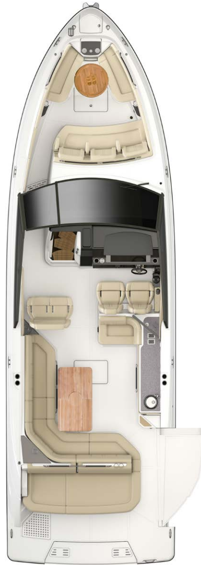
BOW & COCKPIT